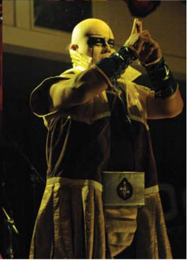
* UCHUSENTAI NOIZ CONCERT COLLAGE Photography by Nergene Arquelada. Group Photo courtesy of addone ltd.