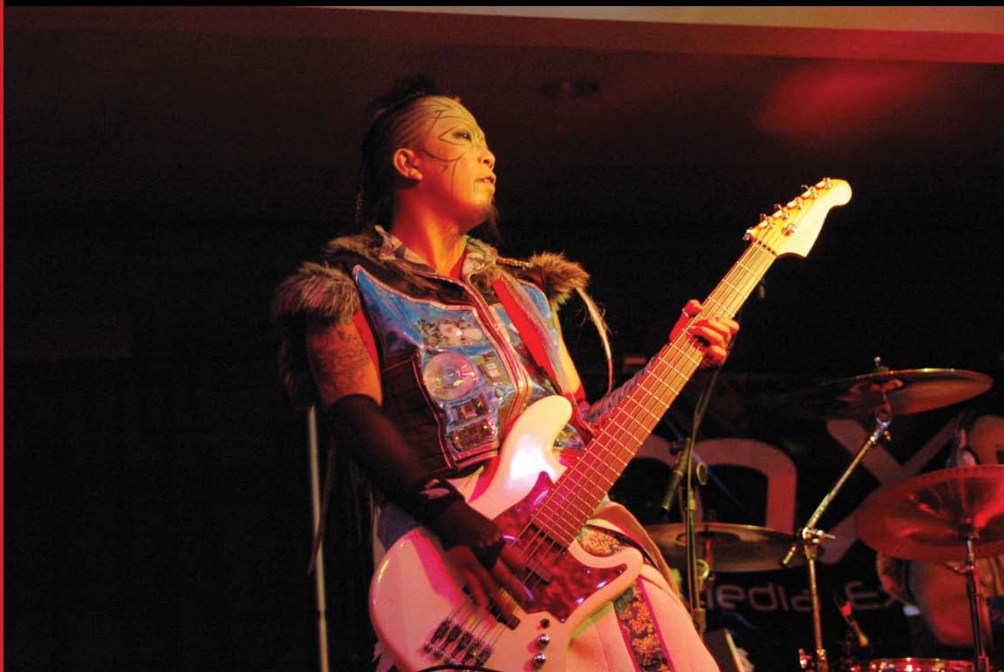
* "Super Vibrator" Kyo on bass.

device were turned off, his hero power would be depleted.